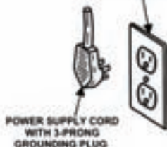
GROUNDING TYPE WALL RECEPTACLE